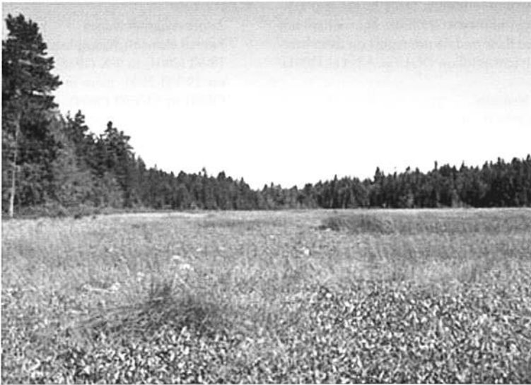
Fig. 3. West end of Hamilton Marsh, view to East, 28 June 2004 (Modified after SIMAIKA, 2005). Vegetation in foreground is generally that of marsh habitat type III (i.e. Menyanthes trifoliata , Carex lanuginosa , and Juncus arcticus ). Common species around the margin are Pinus contorta , Spiraea douglasii and Tsuga heterophylla .

Two beaver dams at the outlets of the marsh account for its present high water mark of 88.75 m above sea level, recorded in 1995. This reading has not changed significantly since a 1981 survey. Low summer water levels range from 20 to 30 cm below the high water mark. This water level decline is the result of seepage, evaporation and annual irrigation use under a water license in effect since 1956. The total volume is estimated at 200,000 m 3 ; the volume below the high water mark is 170,000 m 3 . During the summer, the declining water levels expose much of the dominant Menyanthes trifoliata and Carex spp. vegetation and may even expose the peat and root mat. Rapid succession is occurring; almost 100% of the marsh was open water in 1954, but only 20% or less of the area was open water in 1994 (COUSENS et al., 1996). From 1850 to 1950 much of the forest around the marsh was logged. Between 1940 and 1950,